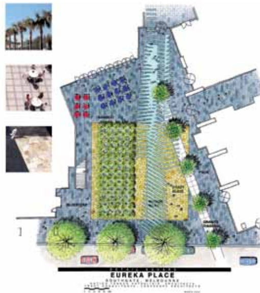
A design for Eureka Place, Southbank, Melbourne.

"Not only does our system increase the efficiency of image and other digital asset searches, it also encourages increased professional communication and interaction between our offices as well as promoting adherence to our branding through the consolidation of templates and guidelines." - Michael Cowled, Tract Consultants.